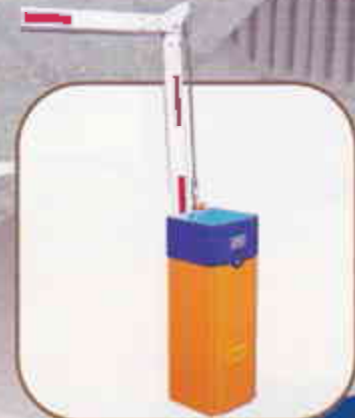
Folding arm 90°