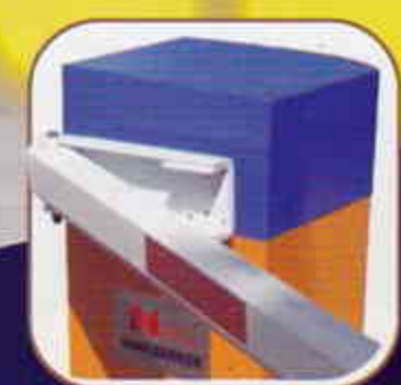
Swing out arm