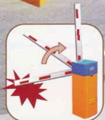
Auto reserve arm